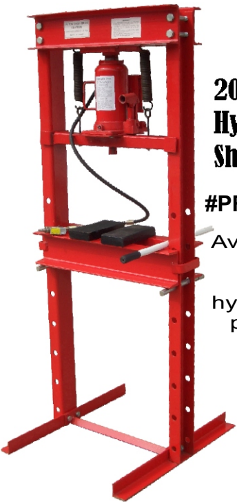
20 Ton Air Hydraulic Shop Press