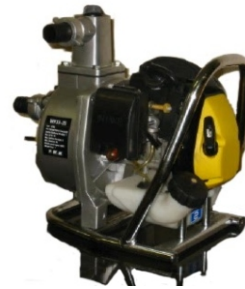
#QWPE11 2 STROKE