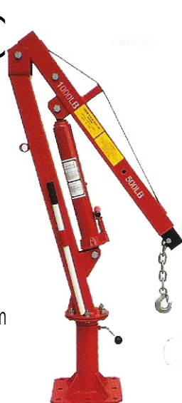
Australian Standard approval No: CC-028

Capacity: 450kgs Working range of boom: 870-1290mm Lifting range: 0-2015mm Overall height folded: 1.45m N.W.: 45.5kg