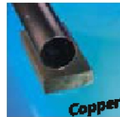
Copper & Brass